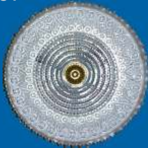
TYPE - FANCY