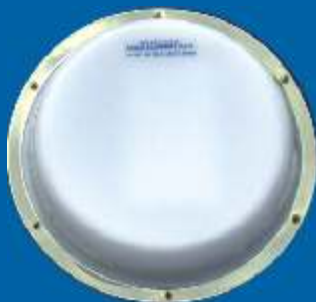
TYPE - E (ROUND)