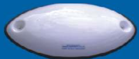
TYPE - OVAL

CFL X 1 : L = 335 x W = 180 x H = 40 CFL X 2 : L = 440 x W = 232 x H = 35