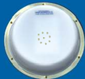
TYPE -E (ROUND WITH NIGHT LAMP)