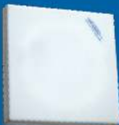
TYPE - E (SQUARE)